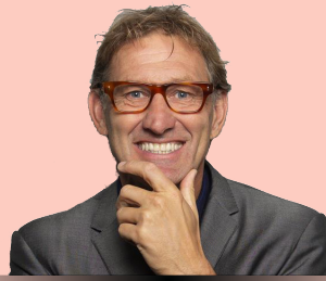
Tony Adams, MBE

'We are really excited to be working with The Devonshire Group and we want to let you know about the services on offer for all of you.'