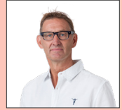
Tony Adams, MBE

We are here for you - please don't hesitate to give us a call.