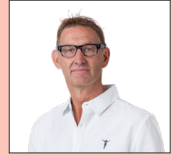
Tony Adams, MBE

We are here for you - please don't hesitate to give us a call.